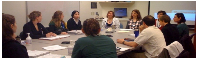
OHSU nursing students discuss a patient's culture at the Simulation and Clinical Learning Center.